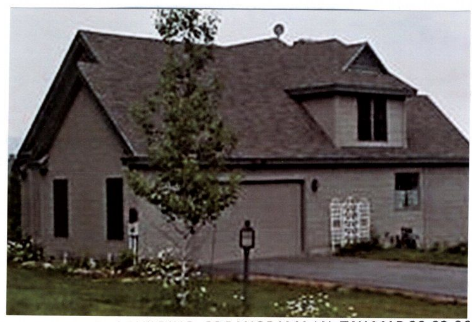
PICTURE OF HANDIBODE BUILDING- 66 PANORAMA LN. TAX MAP 20-02-06. HOUSE HAS 3,052 SQ. FT. W/ 2 BEDRMS & 2 1/2BTHRMS. BLDG. ASSESSED AT $263,400. TOTAL PARCEL ASSESSMT IS $606,400.