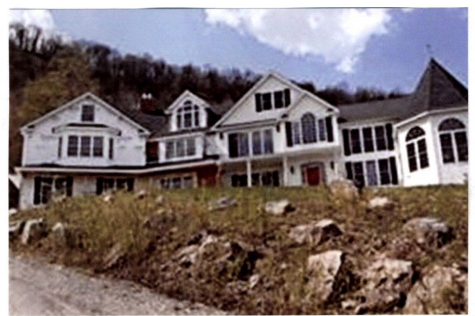
PICTURE OF GREGORY BUILDING- 98 PANORAMA LN. TAX MAP 20-02-11. HOUSE HAS 7,930 SQ. FT. W/ 4 BEDRMS & 3 BTHRMS. BLDG. ASSESSED AT $249,700. TOTAL PARCEL ASSESSMT. IS $581,400.